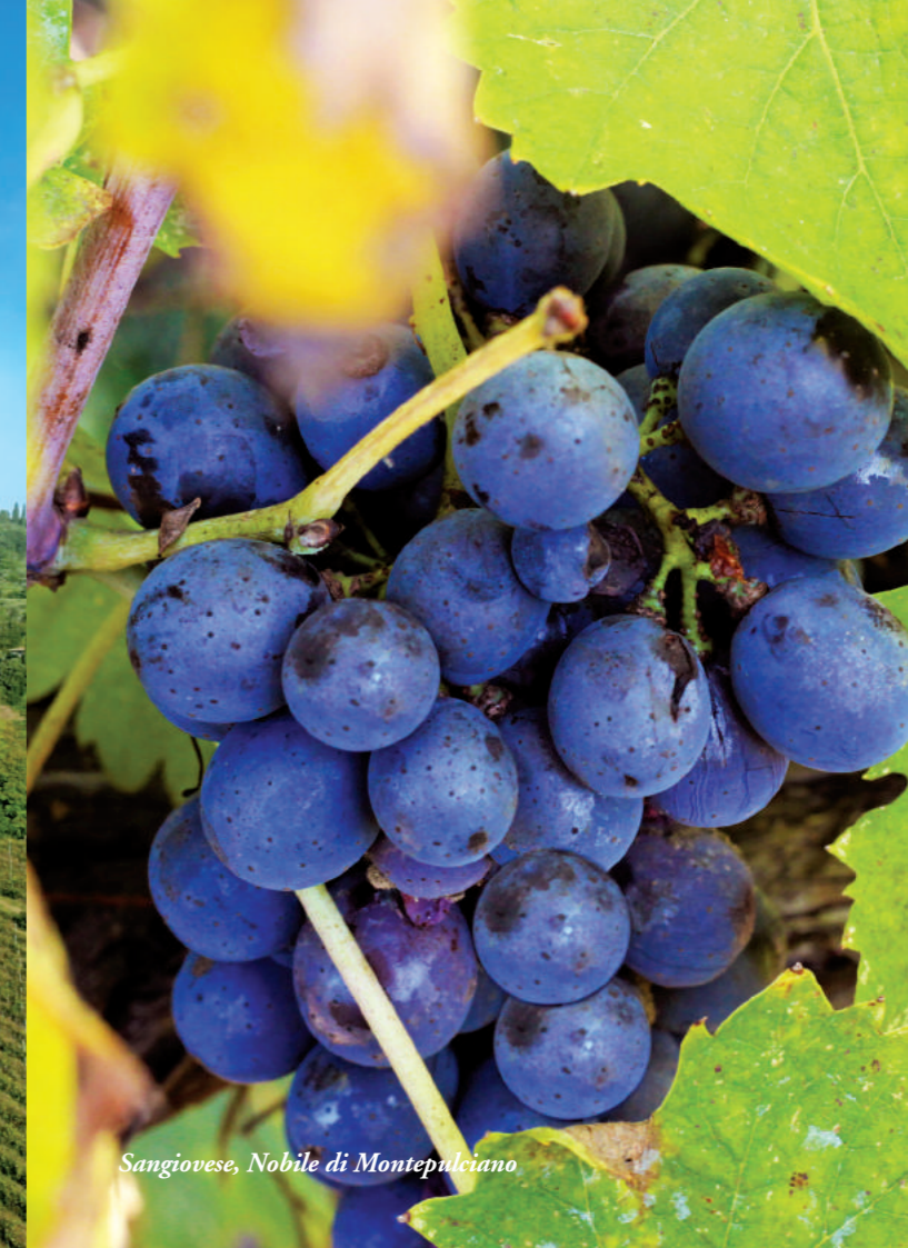
Sangiovese, Nobile di Montepulciano