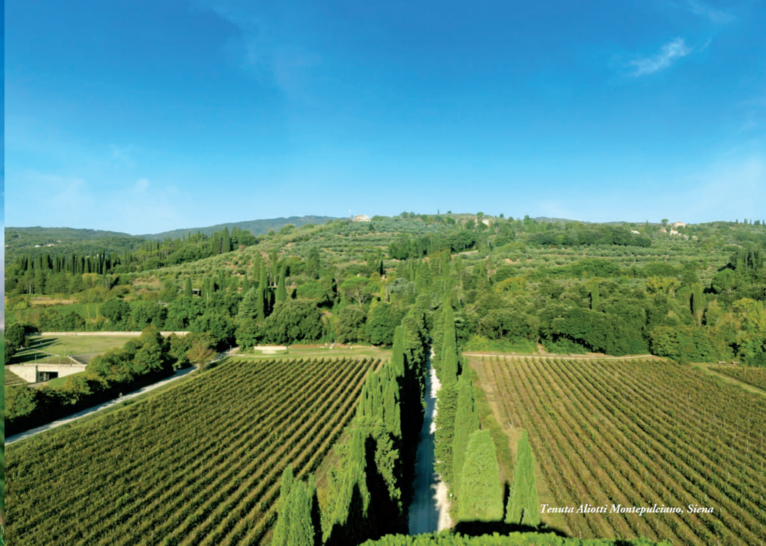
Tenuta Aliotti Montepulciano, Siena